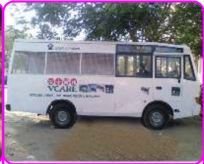
A new larger animal ambulance, thanks to the efforts of our Trustees.

The purpose of the VCARE ABC (Animal Birth Control) programme is to create a friendly, stable, rabies-free street dog population.