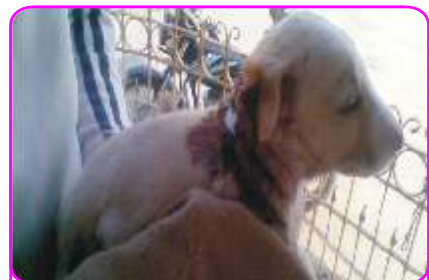
An injured puppy being treated at a camp.