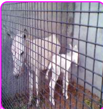
Injured and abandoned mother and baby donkey at the VCARE Donkey shelter