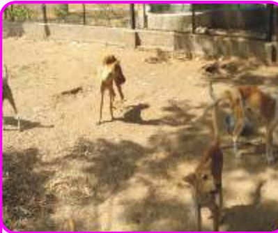
Dogs in the dog run for post operative care.