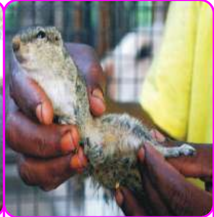
An injured baby squirrel recuperating at the shelter.