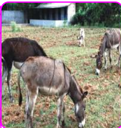
Injured and abandoned donkeys at the VCARE donkey Shelter.