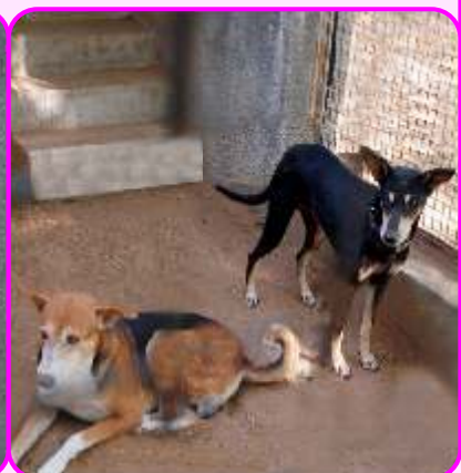
VCARE'S 'Aashiyana', Boarding Kennel for dogs at Lakdikui.