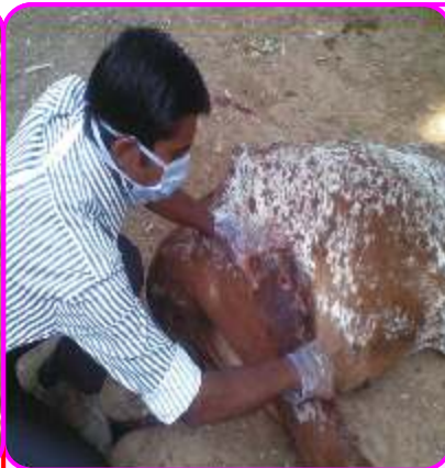
A cow injured in a road accident being treated by our Vet