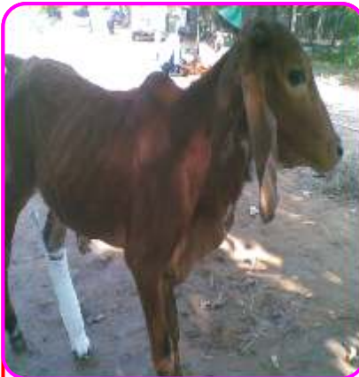
A calf with a fractured leg after treatment at the VCARE shelter