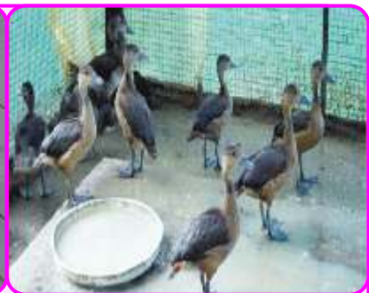
These Nakta ducklings were rescued from an un finished, semi open 9th floor apartment in Lotus Court, behind Landmark building, Race Course Circle. They were hand reared at our shelter for about 8 months and then successfully released into the wild.