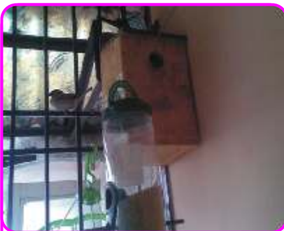
A sparrow has made its home in a specially designed sparrow house by a naturalist in Nasik with the hope of saving these rapidly disappearing birds as its natural habitat is being destroyed.