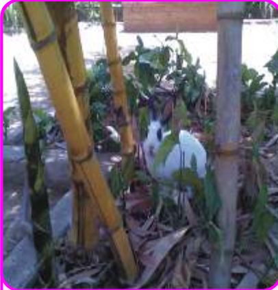
This Abandoned pet Rabbit is enjoying its stay at the VCARE Shelter, Lakdikui.