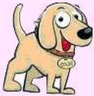
Rescued stray puppies enjoying food and stay at the VCARE puppy enclosure at our shelter in Lakdikui in the outskirts of Vadodara.